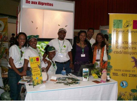
Ile Aux aigrettes Team at the fair

Ile Aux aigrettes is Winner of the 2005 Global Vision Award in Ecological Conservation