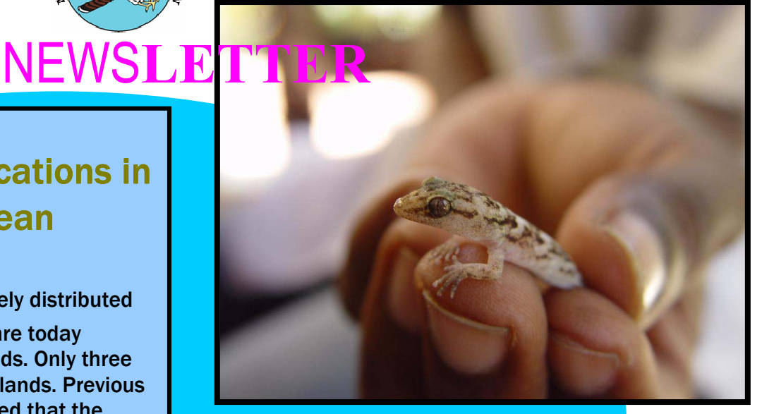
Lesser Night Gecko (Nactus coindemirensis)