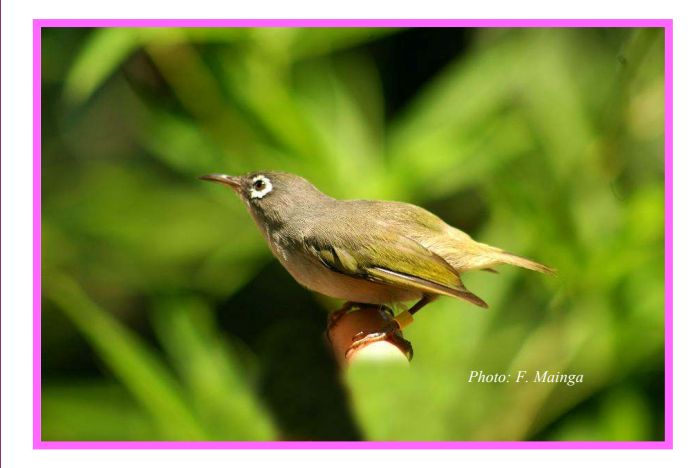
Olive White-eye (Zosterops chloronothos)