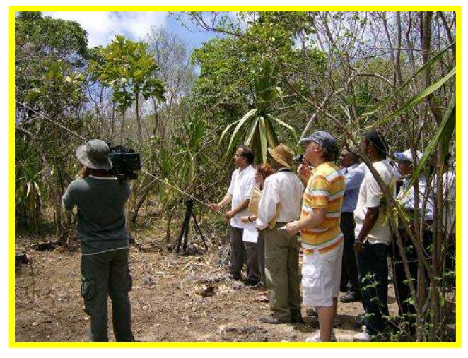
The aviary being opened to release the birds

he Chester Zoo, Durrell Wildlife Conservation Trust & MWF hand-rearing team successfully reared four Olive White-eyes in the 2005-2006 season when the contents of two nests were rescued. Eggs from wild nests of Olive White-eyes were also rescued during this breeding season in the mainland forest & were brought down to the *GDEWS. The eggs hatched & the chicks were fed by hand. Four of these chicks were released on 9<sup>th</sup> of December. A small number of Olive White-eyes may stay at the *GDEWS aviary to establish a captive population of birds to provide an additional source of birds for further introduction programmes, whilst allowing parallel captive studies to gain a better understanding of the species biology and management requirements. *Gerald Durrell Endemic Wildlife Sanctuary